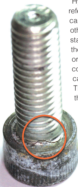
Figure 1: M10 electroplated 12.9 screw cracked under the head